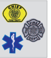
Optional Reflexite® and 3M™ Scotchlite™ retroreflective fronts