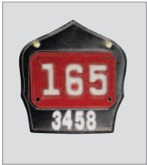
Optional FDNY Firefighter front