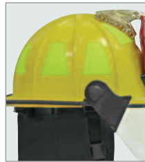
Optional 8 trapezoids 3M™ Scotchlite™ lime or orange