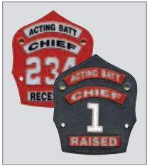
Optional Acting Batt Chief (recessed or raised) front