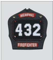
Optional Memphis front