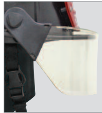
Optional APEC 4" x .150" faceshield