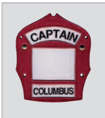
Optional Columbus or Chicago front