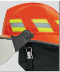
Optional 3 sets of parallelograms Reflexite® lime or 3M™ Scotchlite™ lime or orange, 2-tone lime or orange