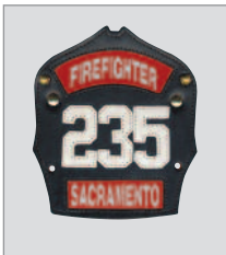
Optional Sacramento front