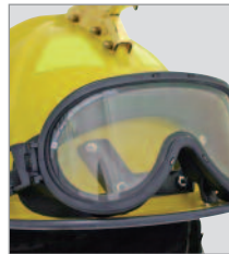
Optional Paulson or ESS NFPA 1971 goggles