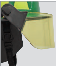
Optional DURA-Shield 4" x .150"