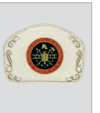
Optional multi-color integral front