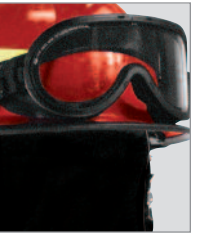
Optional Paulson or ESS NFPA 1971 goggles