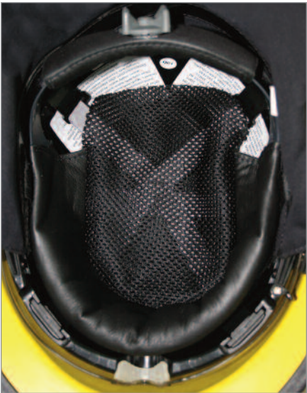
Our Standard Is a Deluxe Model

Unlike the competition's helmets, our standard models include leather headband and ratchet covers and an easy-to-adjust hook and loop headband system.