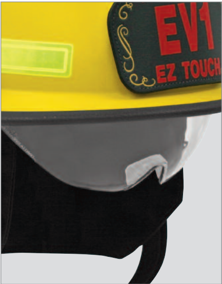
Internal EZ Touch Face and Eye Protection

Proprietary EZ Touch feature allows for one-touch deployment of your face and eye protection. No fuss. No hassle. Stows internally and provides adjustment to fit your face perfectly. Features a safety lock and a cushioned nose guard. EZ Touch face and eye protection is released at the touch of a finger and is the only solution for quick one-hand deployment.