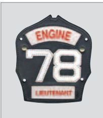
Optional Fort Worth front