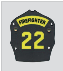
Optional Basic front