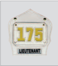
Optional FDNY Covering Officer front