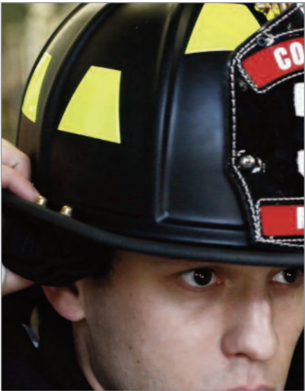
Low Profile Design

Low-profile design combined with lighter-weight materials provides superior comfort, optimal fit, and improved balance.