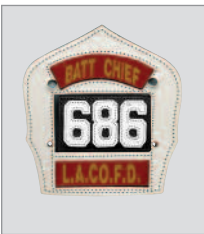
Optional LA County Passport System front