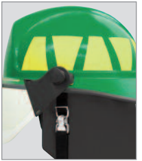
Optional 10 trape- zoids Reflexite® lime or 3M™ Scotchlite™ solid lime or orange, 2-tone lime or orange