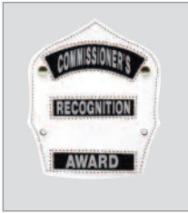
Optional Recognition Award front