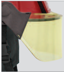
Optional DURA-Shield 4" x .150"