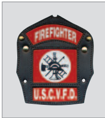
Optional Houston front