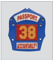
Optional Houston Passport System front