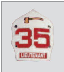
Optional FDNY As- signed Officer front