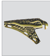
Optional stamped brass traditional eagle front holder