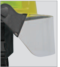
Optional APEC 4" x .110", 4" x .150", or 6" x .130" faceshields