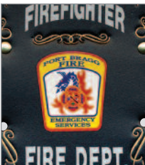
Optional Multicolor Integral front

Custom Fronts We can design a leather front to meet your specific needs.