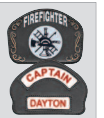
Optional leather passport fronts