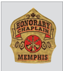
Optional Gold Leaf front