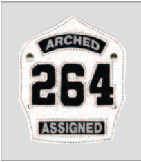
Optional Arched Assigned Officer front