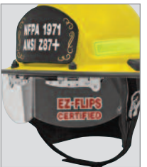
Optional EZ-Flips (NFPA 1971 and ANSI Z87.1)