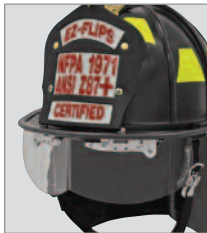
Optional EZ-Flips (NFPA 1971 and ANSI Z87.1)