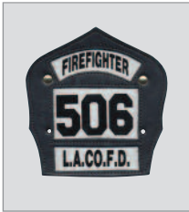
Optional LA County front