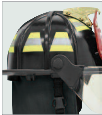
Optional 8 trapezoids 3M™ Scotchlite™ 2-tone lime or orange