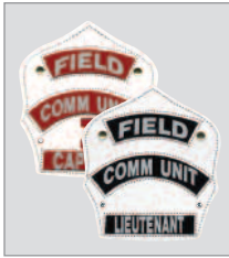
Optional Field Comm Unit (recessed or raised) fronts